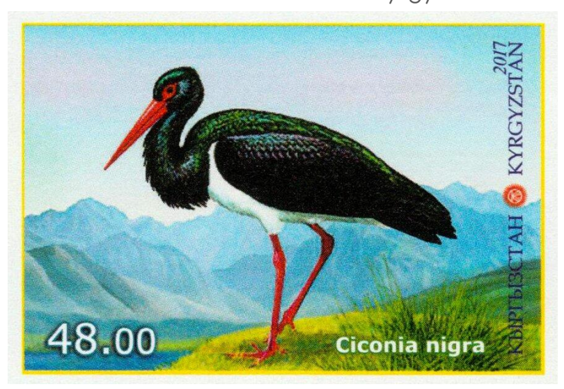
«aucm» (aist) is a Russian word for stork

a famously rare black stork from the stamp series 'Flora and Fauna of Kyrgyzstan'